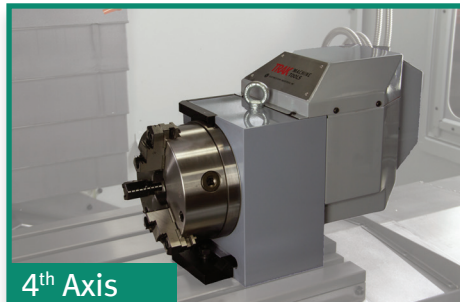
4 th Axis