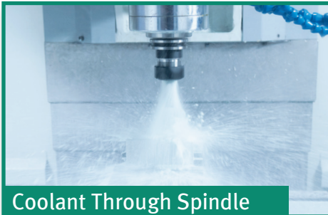
Coolant Through Spindle

Today Make great parts, fast. The features you need for production machining.