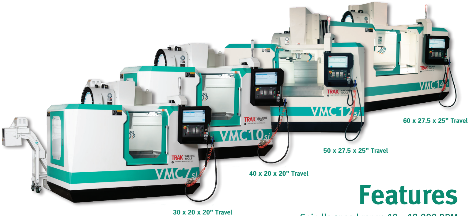
60 x 27.5 x 25" Travel