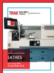
TRAK TRL Lathes