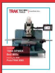
TRAK Bed Mills