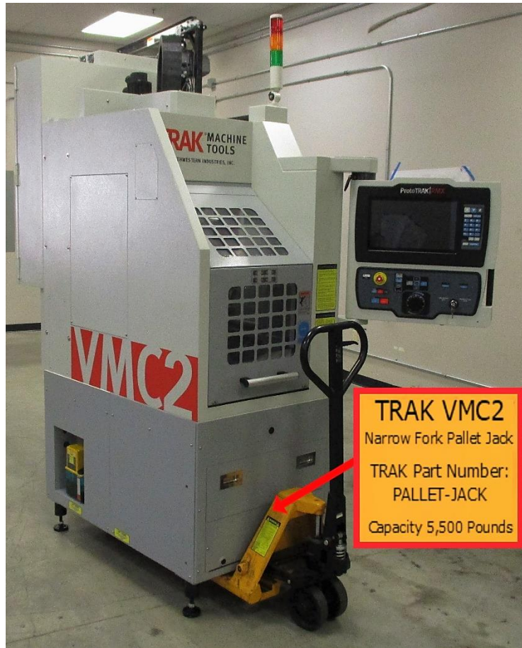
Figure 4 – Moving with Pallet Jack