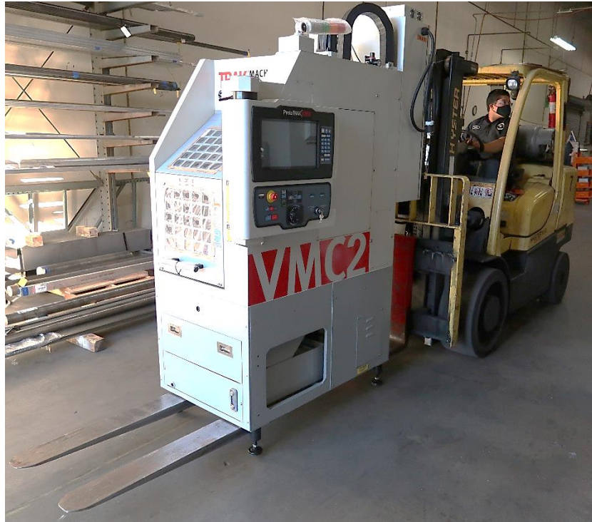
Figure 2 – Lifting the VMC2