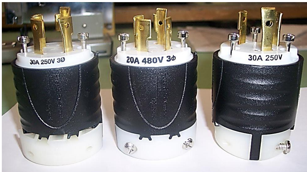
Figure 5 – Electrical Quick Disconnect Plugs (Male)