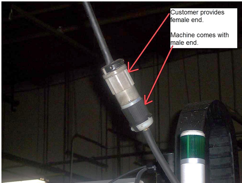
Figure 6 – Power Cable Example