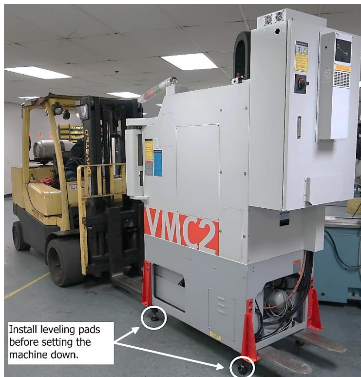
Figure 3 – Installing Leveling Pads